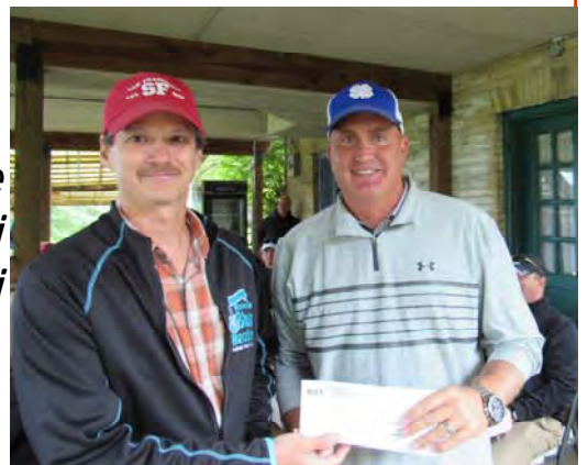
2nd. Place Casa Di Sassi