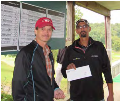
3rd. Place Trademark