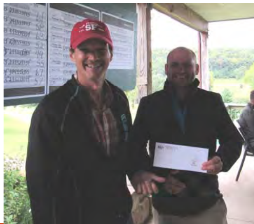
1st Place Dutch Quality Stone