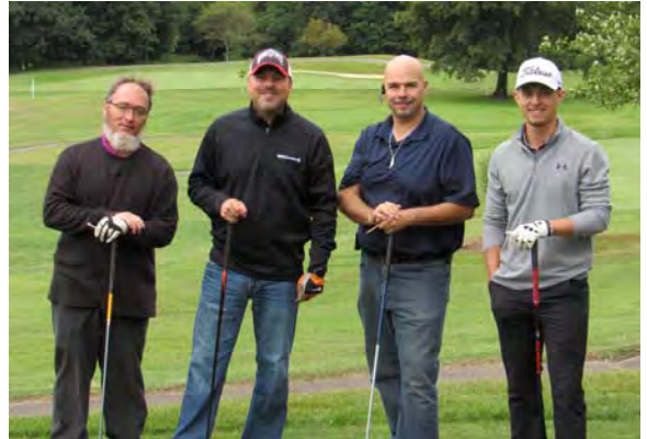
And another Pose